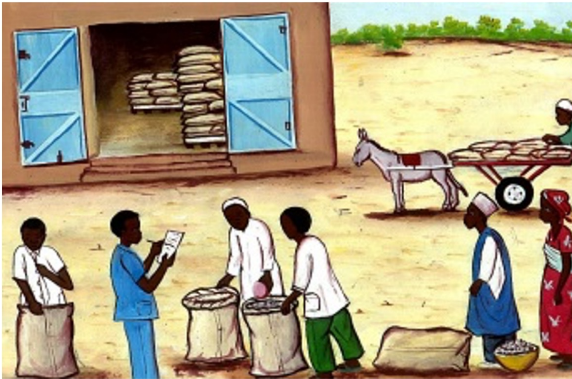
Farmers deliver grain to warehouse, and an officer registers the quantity and quality