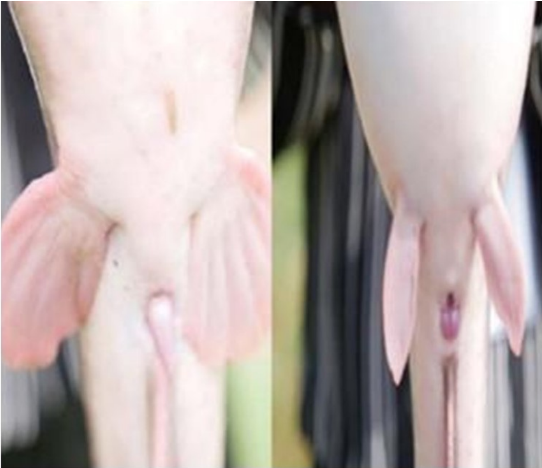
Différences de sexe chez le poisson-chat africain; mâle (gauche), femelle (droite)