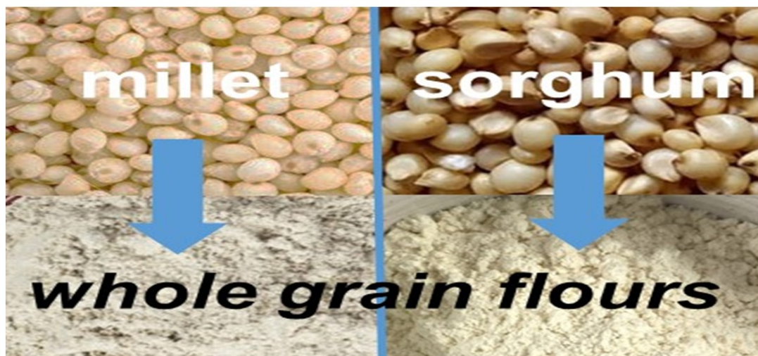
Flours prepared from pearl millet and sorghum