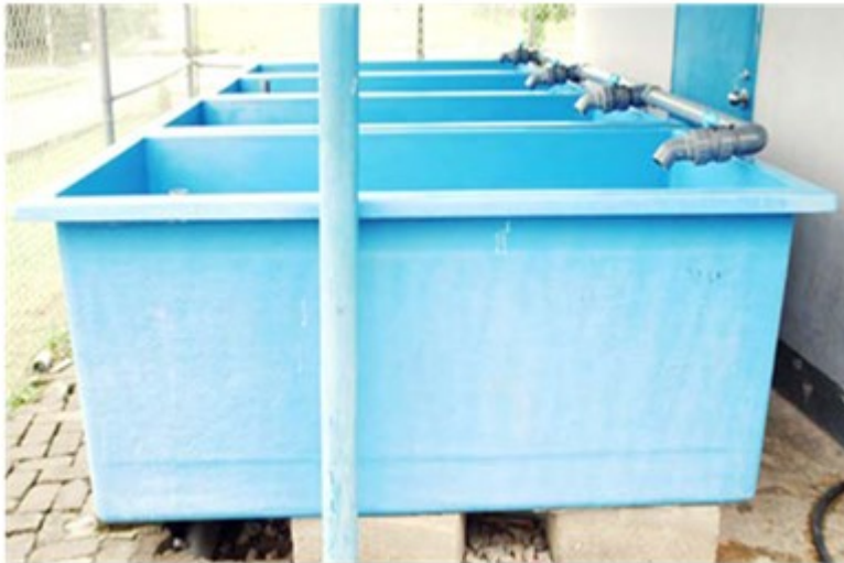
Flow-through tanks with single use of water