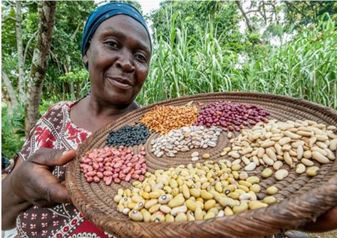
Some common bean varieties cultivated in Uganda