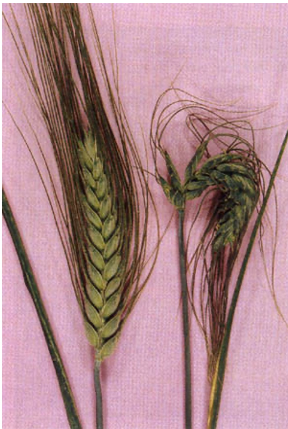
'Fish hook' deformation of the ear (right) caused by wheat aphid, compared to a