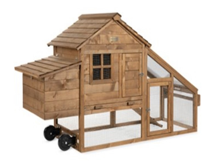
A moveable poultry house for free-range production with sheltered forage area