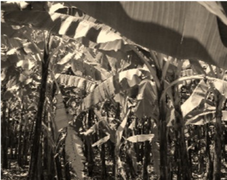
Differences in plant spacing; low density (left) and high density (right)