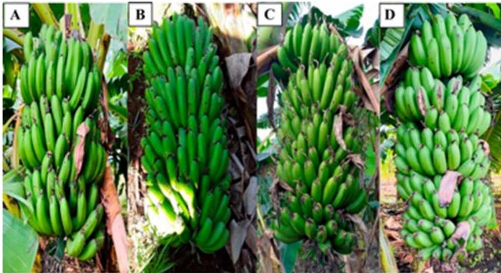
Bunches of new Matooke cooking banana cultivars, A to D = TARIBAN 1 to 4 (Credit: Madalla et al. 2022)