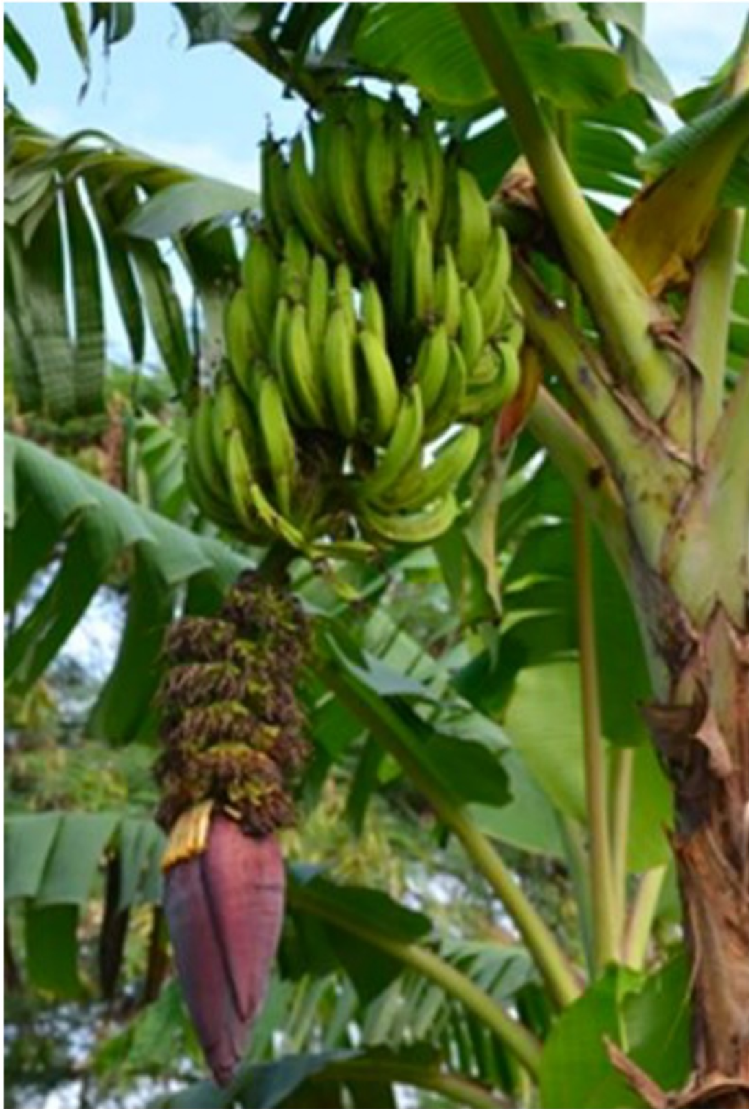
Sika Plantain (Credit: B. Dhed'a)