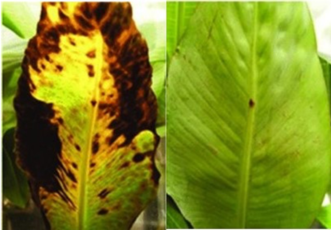
Effect of black leaf streak on plantain; susceptible variety, left and resistant variety, right (Credit: Alvarez et al. 2015)