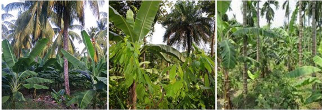
Complex banana intercropping systems where banana is the understory of coconut (left); banana is grown beneath oil palm with a cacao understory (center); and a multi-story garden that includes palms, spices and banana (right)