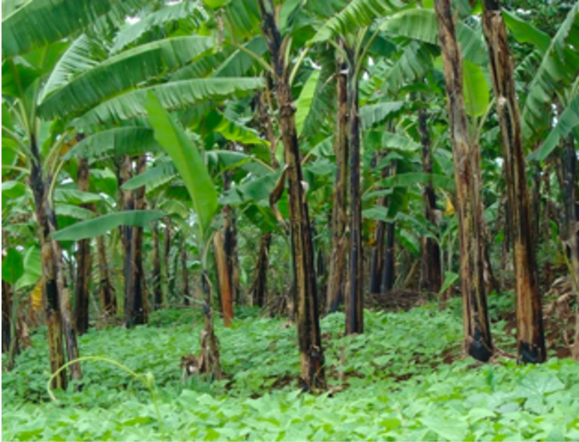
Banana with common bean understory