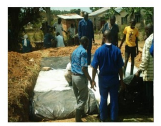
c) Closing the silage by wrapping and fixing the plastic sheets