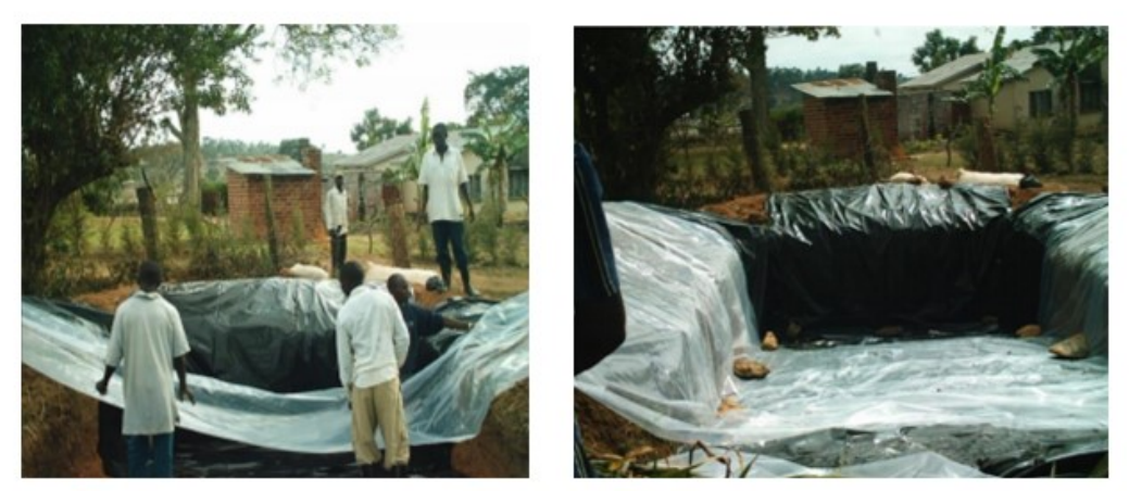
a) Digging a trench and lining it with plastic sheets