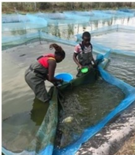
Collection of fingerlings from hapa