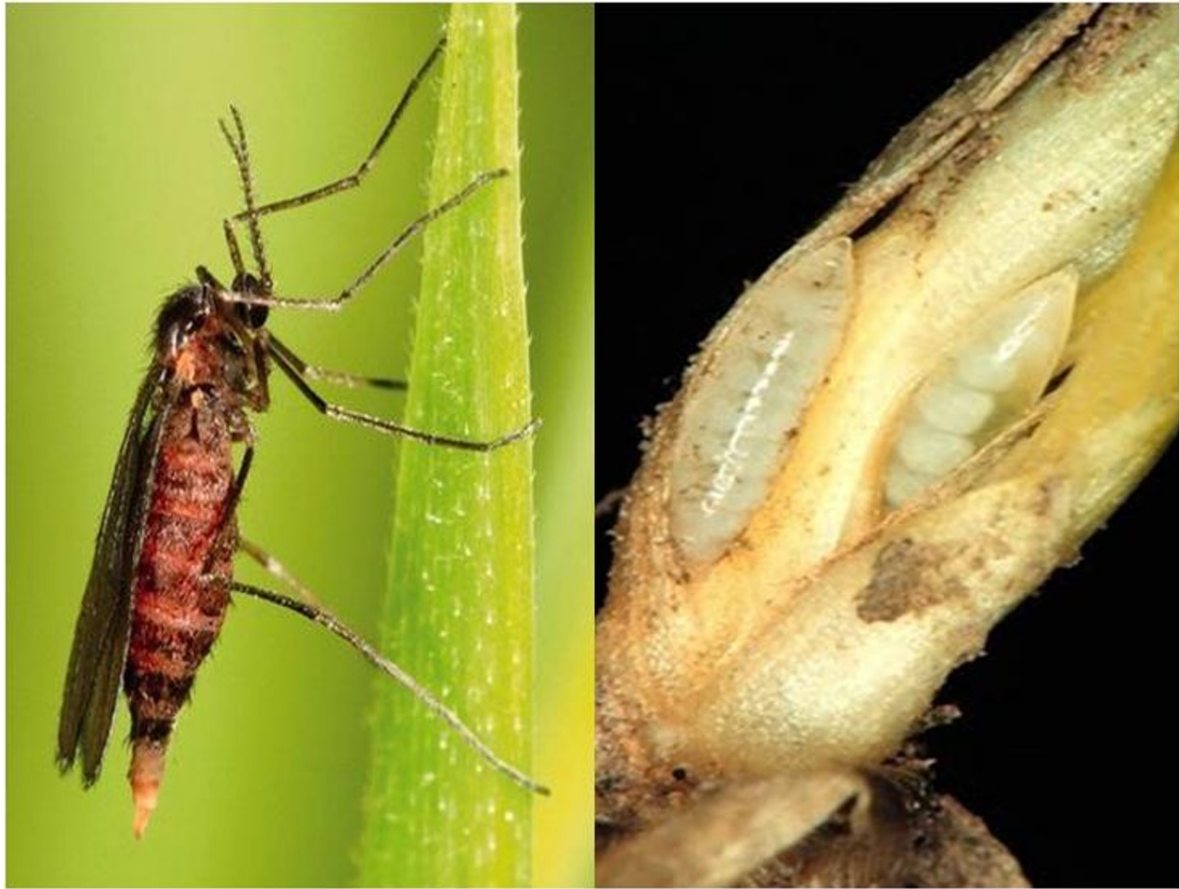
Hessian fly adult (left) and larvae and damage to wheat (right)