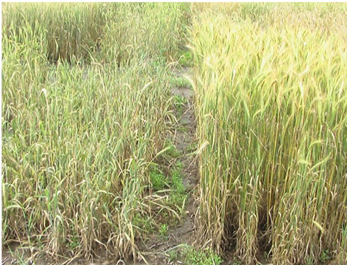
Performance of wheat varieties sensitive (left) and resistant (right) to Hessian fly