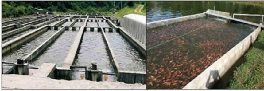
A network of parallel raceways (left) and red tilapia in an intensively managed raceway (right,)