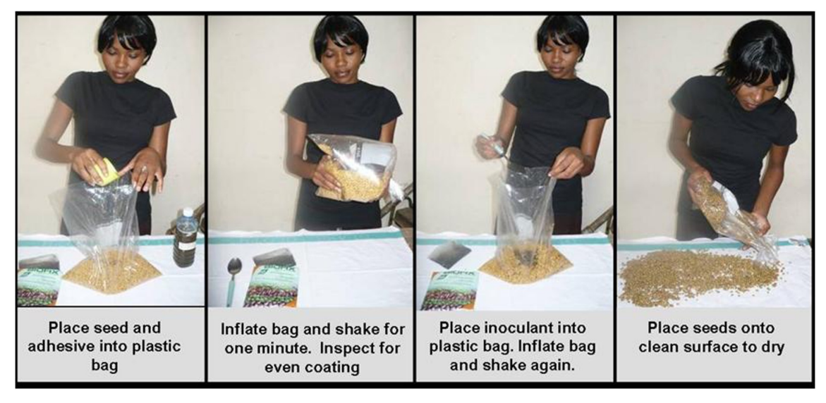
The "two-step" procedure of seed inoculation that results in effective coverage with elite rhizobial