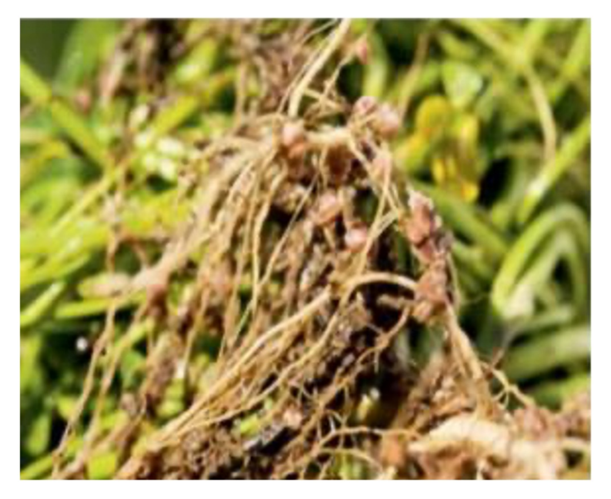
Nodules with N-fixing bacteria on bean roots