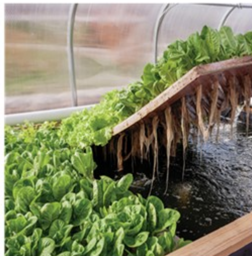
A floating aquaponic system